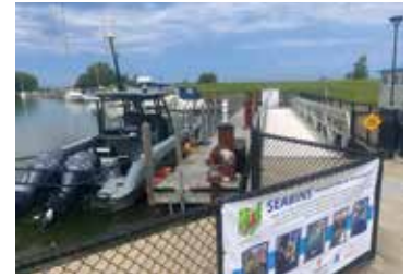
SEABIN PHOTO COURTESY OF OHIO SEA GRANT

For more information, visit KEEPOHIOBEAUTIFUL.ORG .